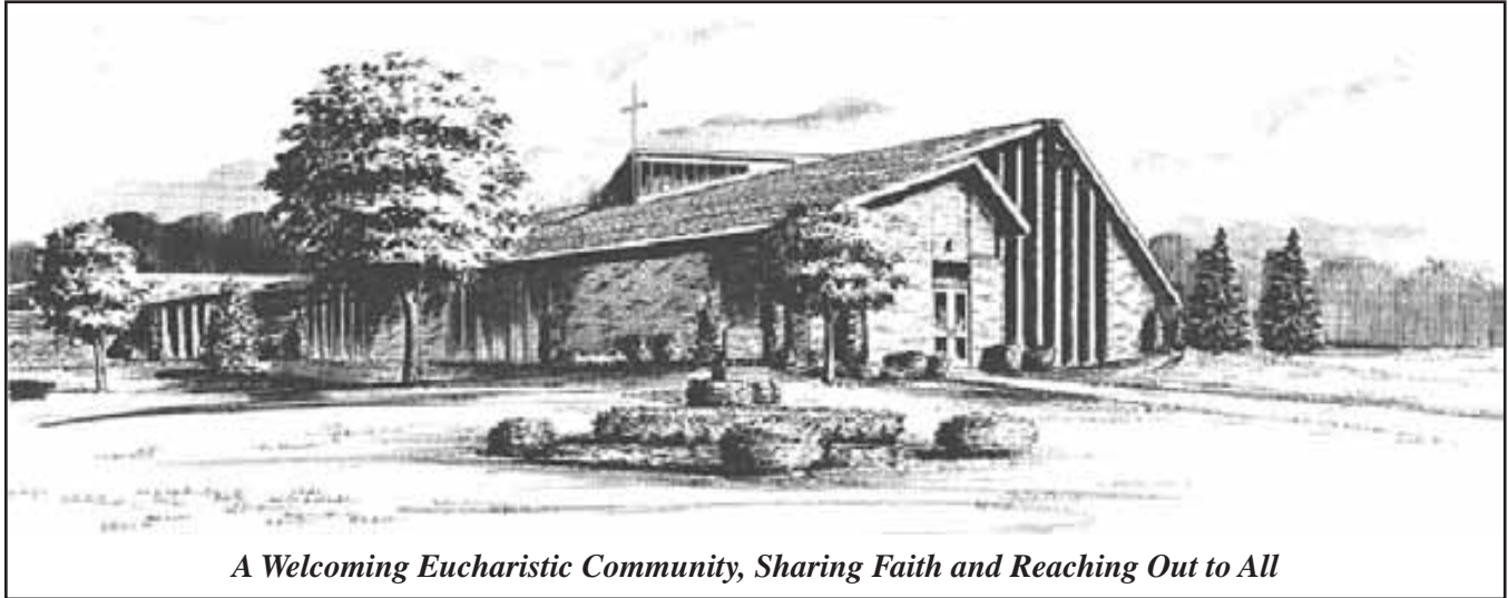
A Welcoming Eucharistic Community, Sharing Faith and Reaching Out to All

511 CHEAPSIDE ST., LONDON, ONTARIO N5Y 3X5 PHONE 519-433-6689 FAX 519-433-2301 E-MAIL: stmichlon@dol.ca www.stmichaels.dioceseoflondon.ca